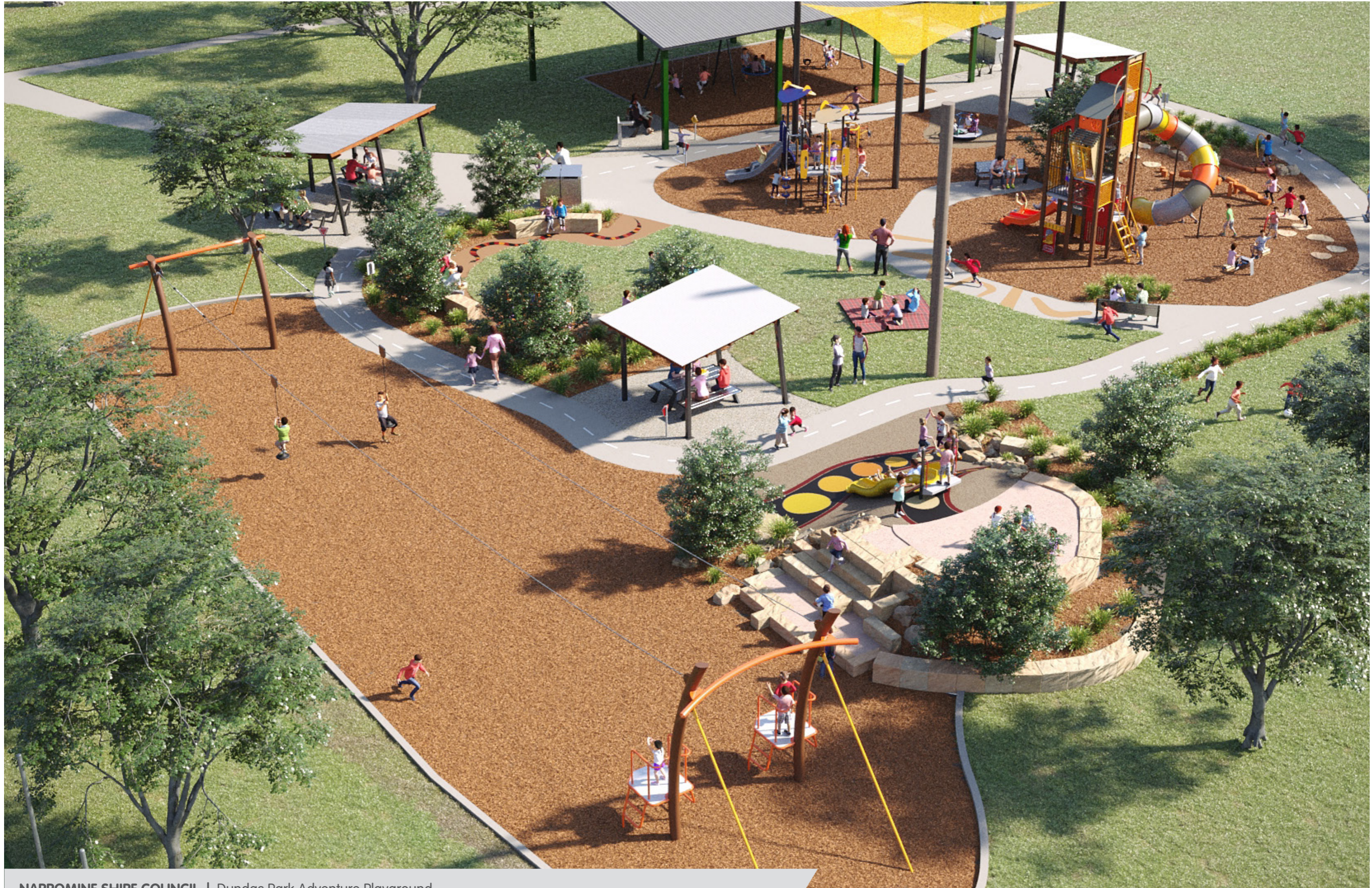
NARROMINE SHIRE COUNCIL | Dundas Park Adventure Playground