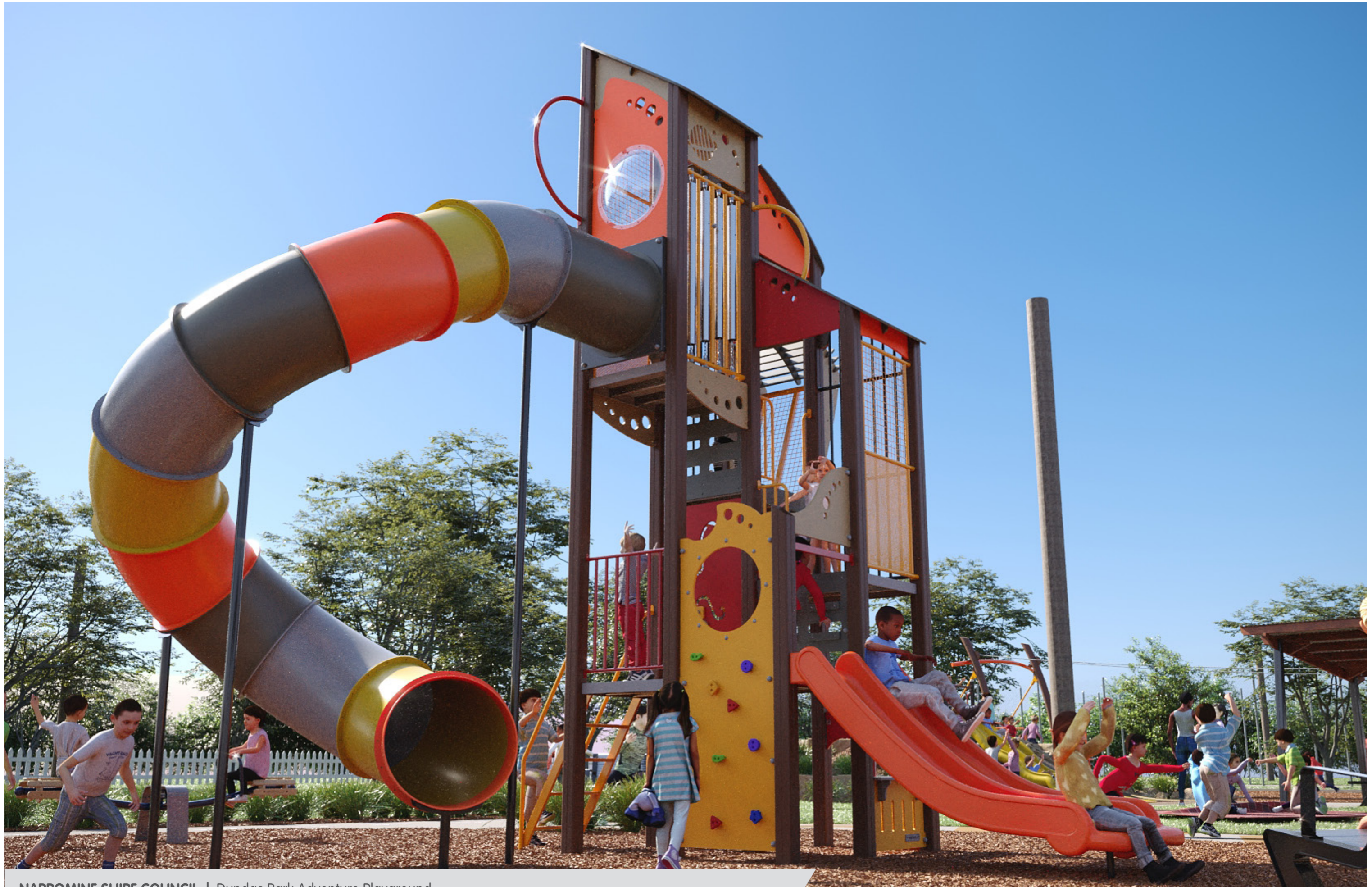
NARROMINE SHIRE COUNCIL | Dundas Park Adventure Playground