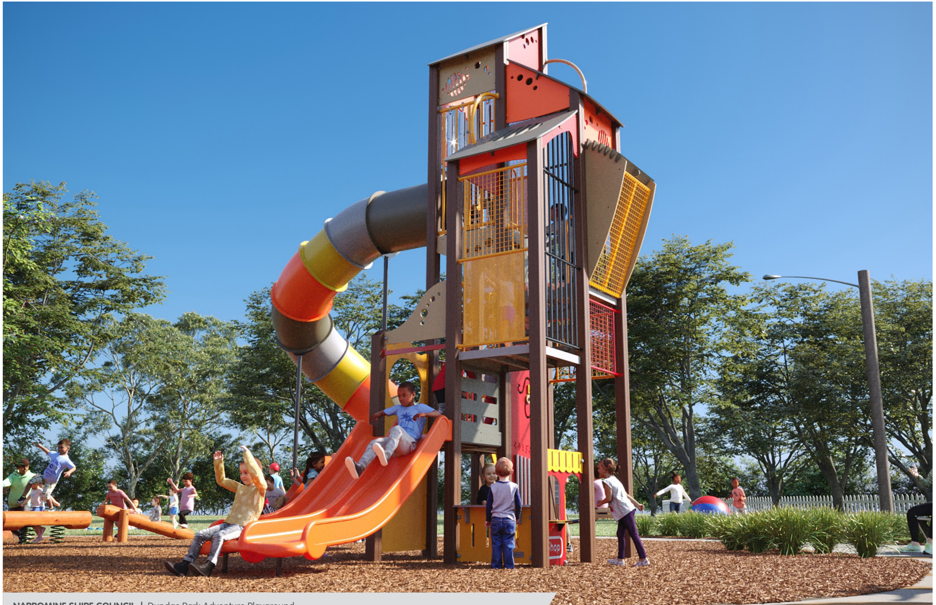
NARROMINE SHIRE COUNCIL | Dundas Park Adventure Playground