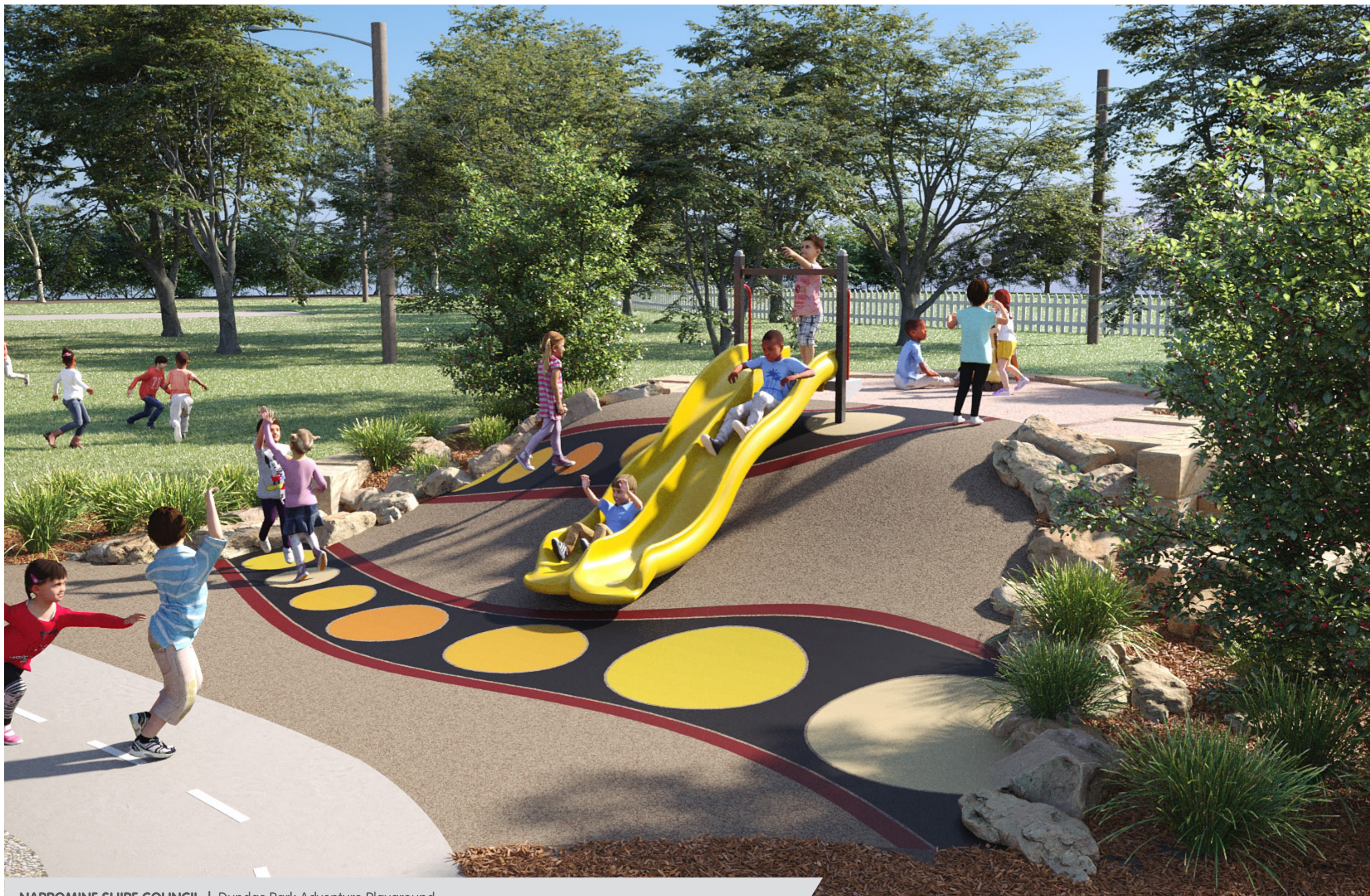
NARROMINE SHIRE COUNCIL | Dundas Park Adventure Playground